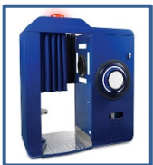
Photo Booth at Receptions

(Wednesday, May 29, Thursday, May 30, or Friday, May 31)